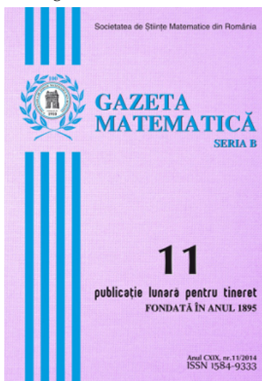
Cover of the first issue of Gazeta Matematică (1895, left) and a recent issue 11/2014 (right).

Amongst its many merits along the time, we mention: 1) the essential contribution for the establishment of an extraordinary mathematics competition atmosphere in Romania that led to the creation of the Romanian School of Mathematics; 2) creation of the IMO (International Mathematics Olympiad), nowadays the largest and most prestigious mathematics contest in the world for high school students (with 109 participating countries and 602 contestants in 2016, see https://www.imo-official.org/year_info.aspx?year=2016 ).